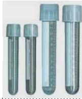
Polystyrene with dual-position caps.