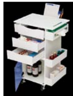
51007 Lab Cart