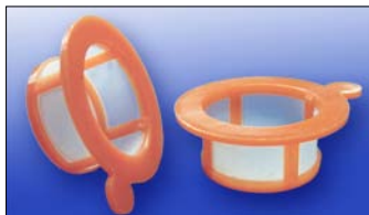
Nylon mesh with polypropylene frame.

Utility, stainless steel, Lakeside 200 lb Capacity 27½"(L) x 16¼"(W) x 32½"(H). 311 ..... $246.00 Model 311 can ship UPS 30¾"(L) x 18¾"(W) x 33"(H). 322 ..... $280.00 500 lb Capacity, 31"(L) x 19"(W) x 32½"(H). 422 ..... $358.00 Lab, TrippNT. 51007 ..... $559.00 23"(L) x 17"(W) x 35"(H)