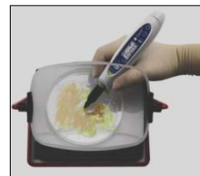
(Magnifier not included)

Benchtop, 0-999 range 1-Key, USA. CDI/1 ..... $61.00 2-Key, USA. CDI/2 ..... $105.00 5-Key (6-unit) Economy, China. HS5360A ..... $238.00 Deluxe, USA. CDI/6 ..... $320.00 8-Key (9-unit) Economy, China. HS5360B ..... $323.00 Deluxe, USA. CDI/9 ..... $406.00