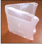
Plastic Mailer 2-Slide